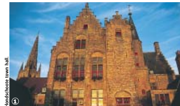
Hondschoote town hall.