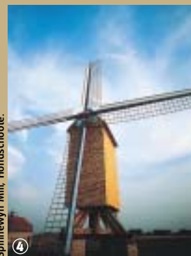
Spinnewyn Mill, Hondschoote.

The people of Hondschoote should however be disabused of this very ephemeral distinction. It is nothing compared to the sense for celebrations and traditions that they, like every Flemish person, possess. In this connection there is a story going the rounds in the local villages. The morning after a particularly well-lubricated celebration, the people of Hondschoote confused the early glow of the rising sun with the start of a fire. They therefore decided to try and put out the sun, whence their present-day nickname of "sun-extinguishers"!